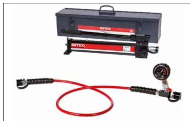
Combi-set AHP 702

Also available as HAND PUMP SET , including: